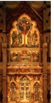
St Paul's Cathedral f13 Clayton & Bell UK