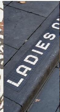
Ladies Only f12 Unknown