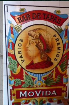
MoVida f9 Imported Spanish