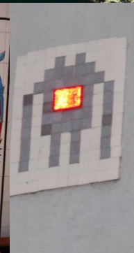
Space Invader f10 Invader