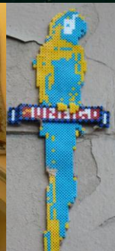
Parrot f8 Unfigo