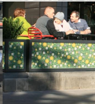
Cervo Café a8 outside panels by Red Design