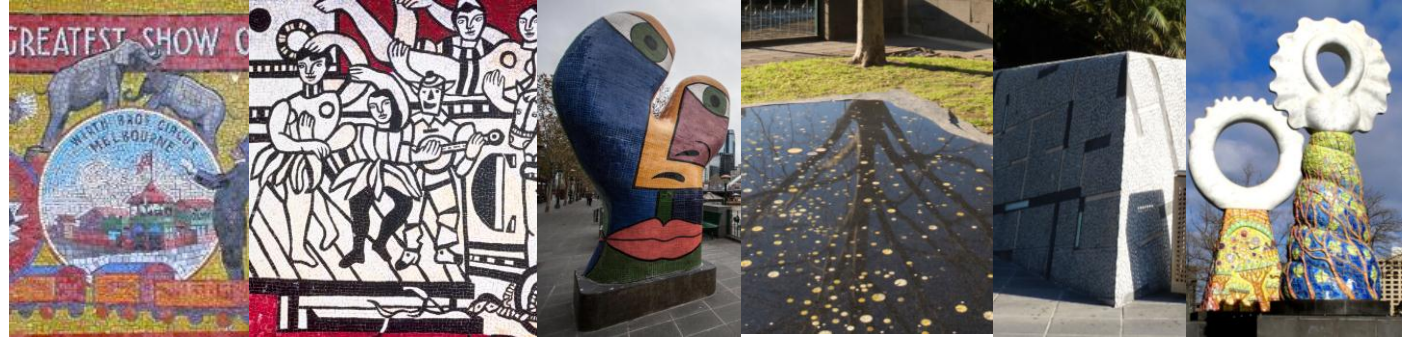
Greatest Show on Earth a1 Melbourne Mural Studio