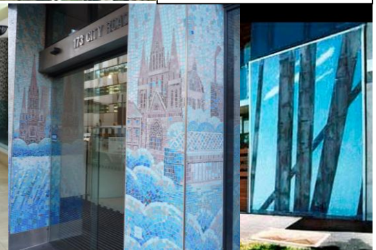
Southbank and City Towers a10&a11 Melbourne Mural Studio