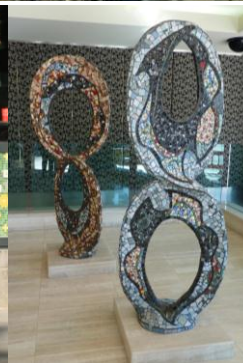
Infinity a9 Mina Shafer